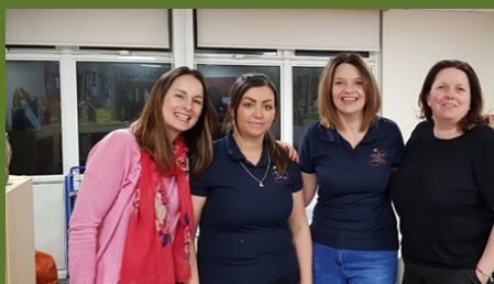
The wonderful Skydivers